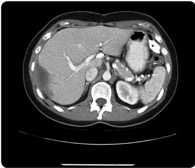
Fig. 3. Significant liver tumor regression during the treatment with imatinib; abdominal metastases are not depicted; December 2010.