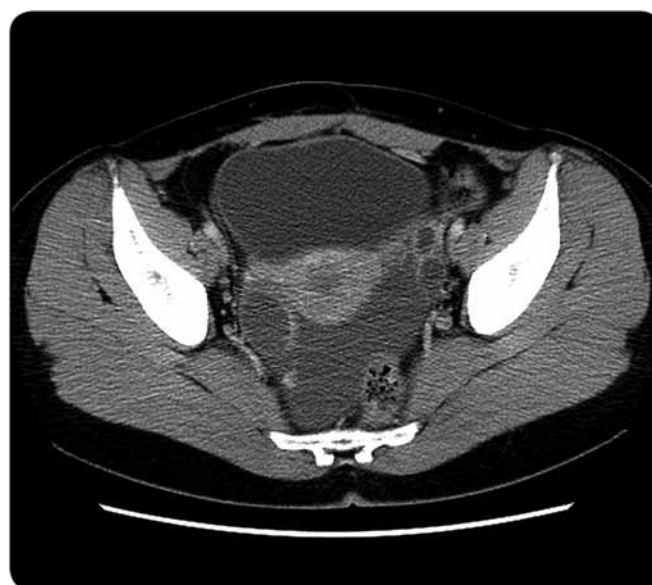
Fig. 2. Large tumor mass in the pelvis prior to initiation of treatment; March 2008.

CK8/18, CD31) were negative. Similarly, immunohistochemistry for C-kit was negative.