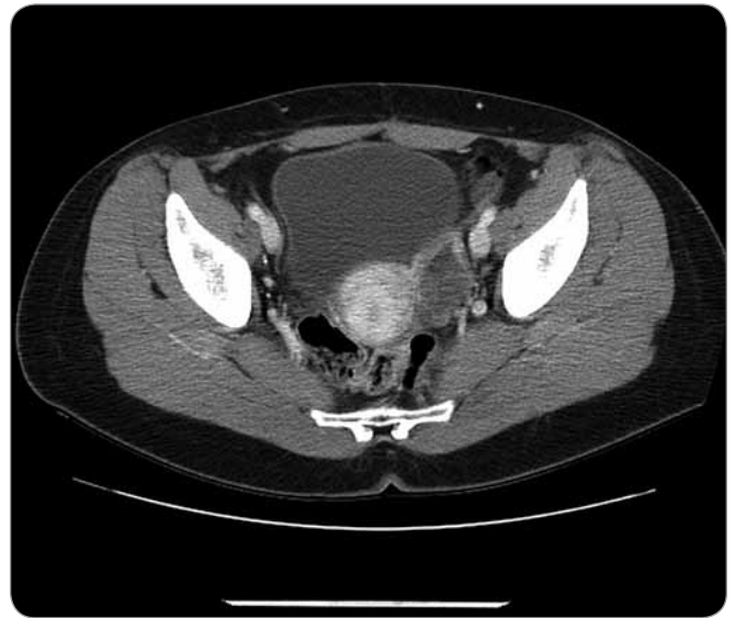
Fig. 4. Significant regression of finding in the pelvis after imatinib therapy; persisting residual cystoid in the left ovary; December 2010.

imatinib mesylate to patients with c-kit negative GISTs, it is necessary to request reimbursement for each respective case.