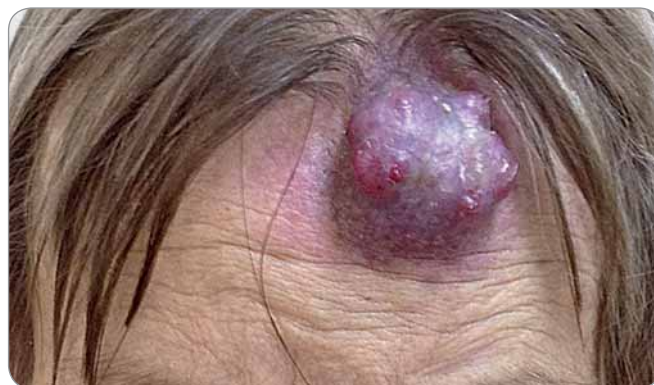
Fig. 2. Erythematous-violaceous lobulate mass on the left forehead.