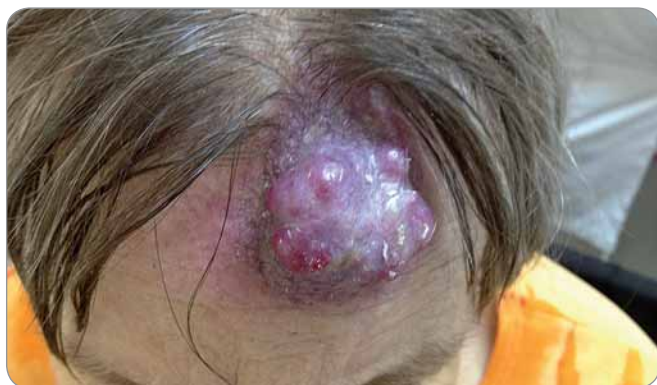
Fig. 1. Erythematous-violaceous lobulate mass on the left forehead.