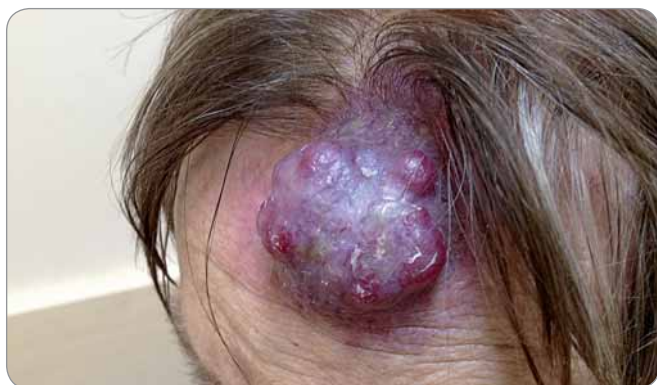
Fig. 3. Erythematous-violaceous lobulate mass on the left forehead.